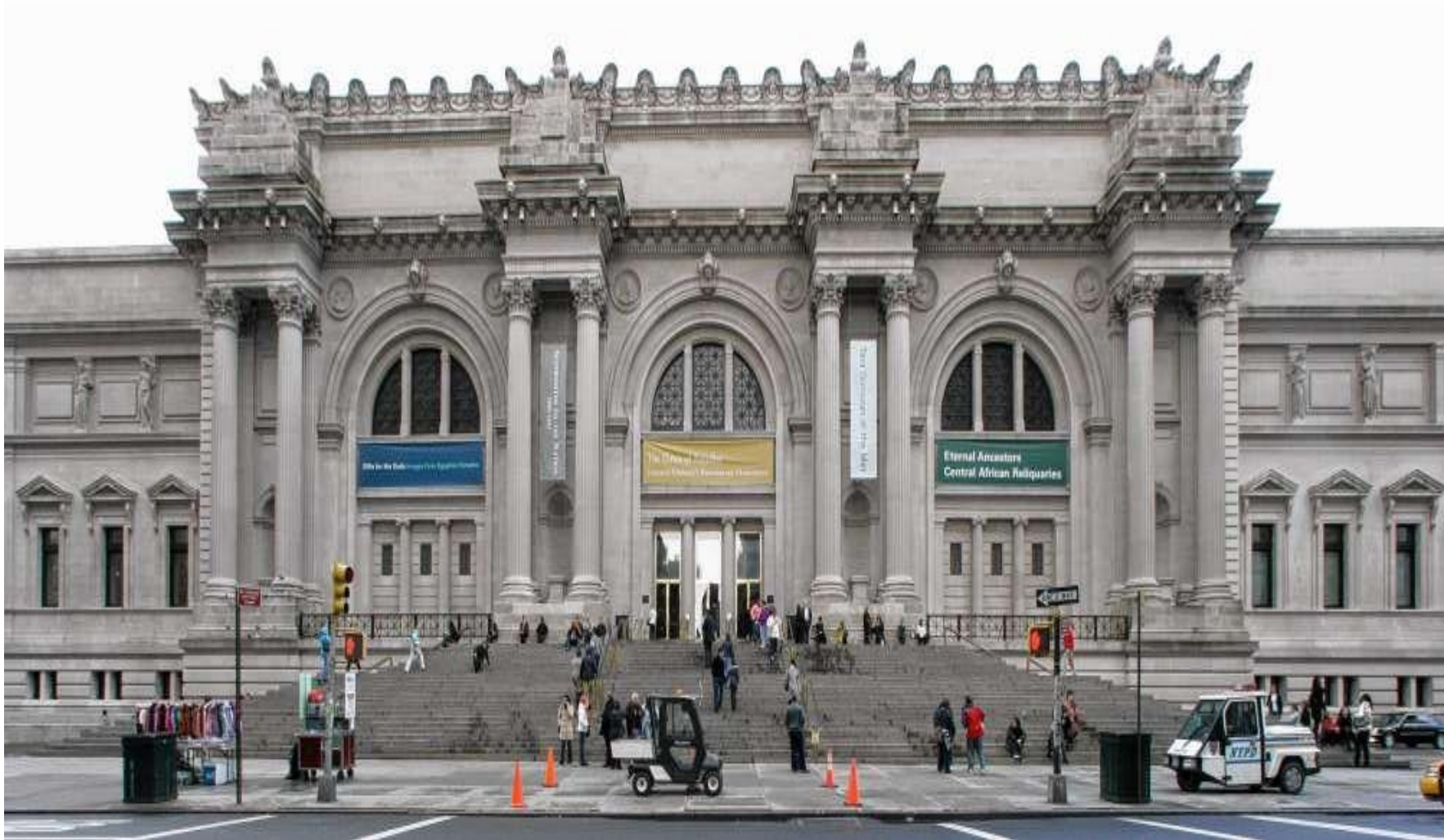
Metropolitan Museum of Art, New York