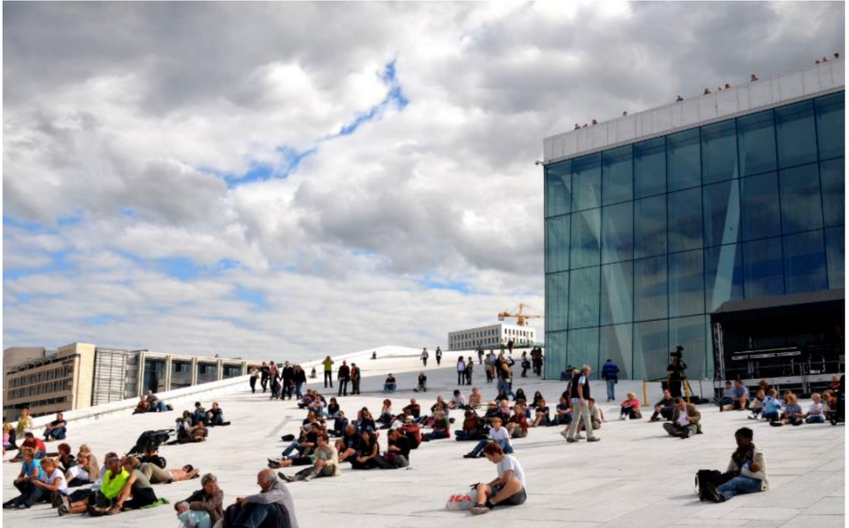
Oslo Opera House, Oslo, Norway