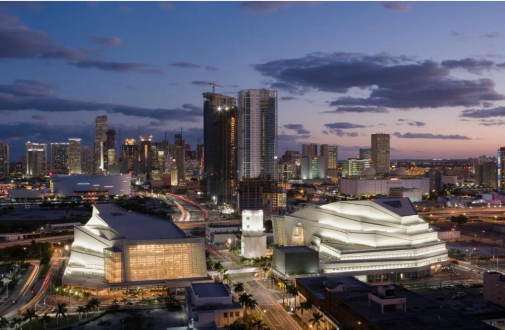
Adrienne Arsht Center for the Performing Arts, Miami, FL