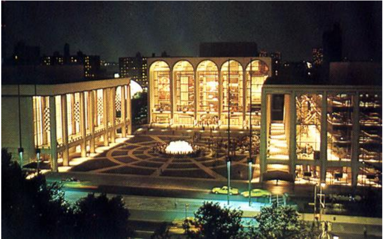
Lincoln Center, New York