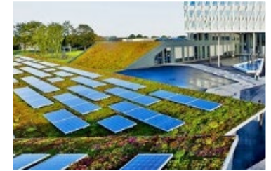
Commercial Operations & Innovation