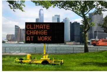
Platform for Environmental Justice Work