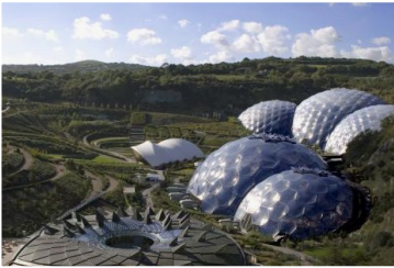
Living Laboratory /Cultural Uses

The Trust plans to release a solicitation targeting an academic or research institution to anchor the proposed climate center sometime in Spring/Summer, 2021