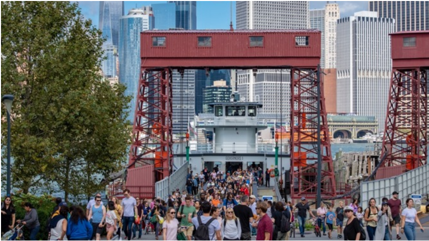
FOCUS ON GATEWAY AREAS

Trust is identifying projects that will support year-round access