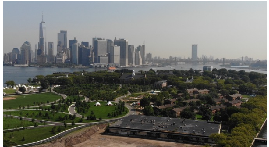
CLIMATE CENTER RESEARCH