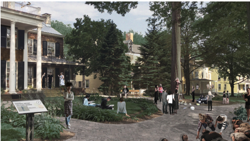
FOCUS ON ATTRACTING YEAR-ROUND TENANTS IN AREAS OF (1) ARTS AND CULTURE; (2) HOSPITALITY; (3) INNOVATION