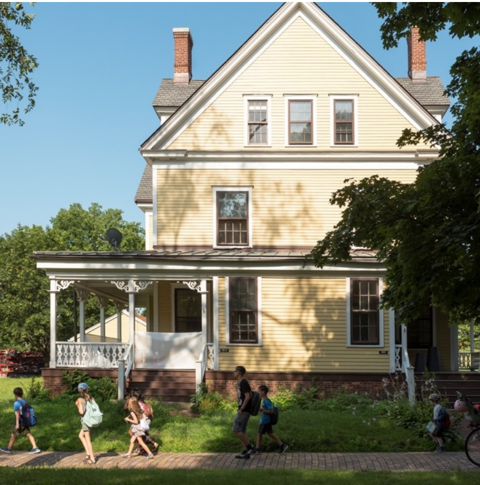
#20 Cultural User