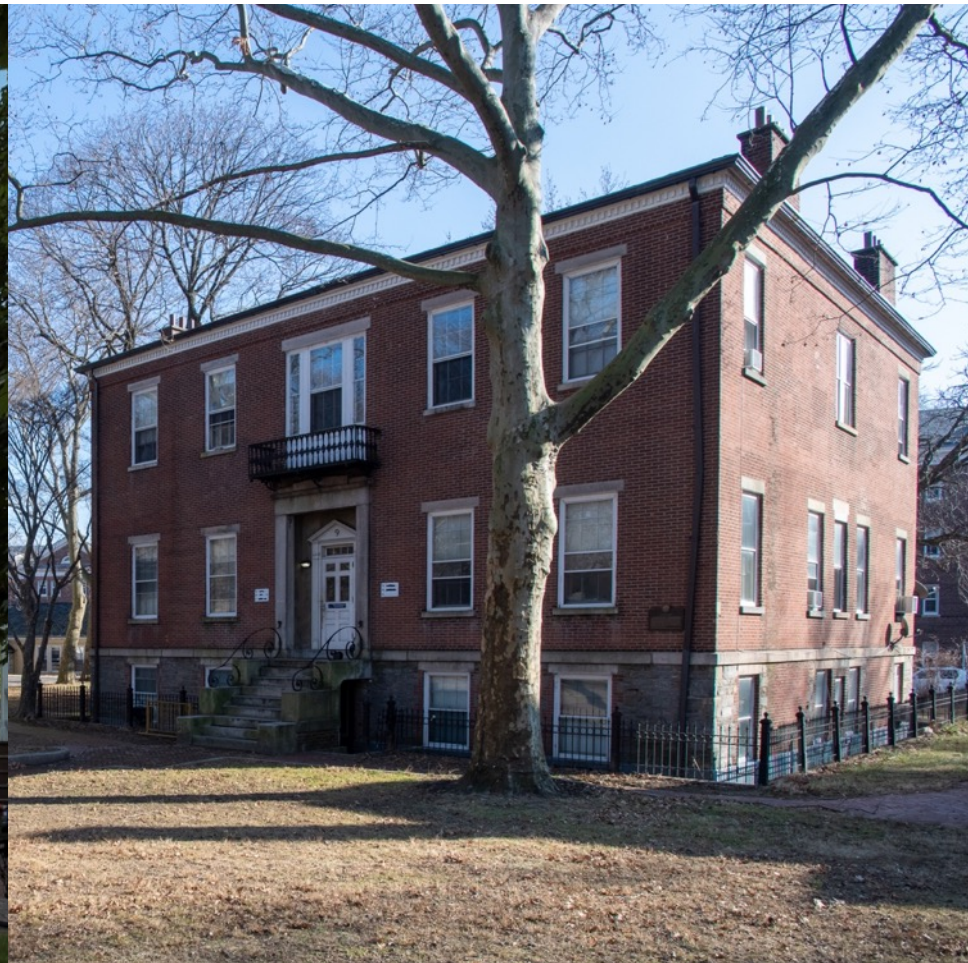
#9 Cultural User or Artist Residency Program