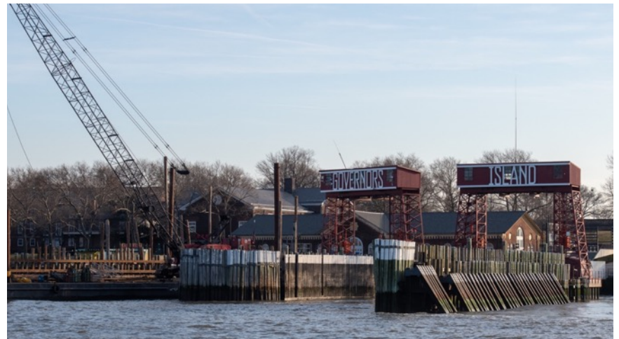
RATIONALIZE INFRASTRUCTURE UPGRADES AROUND DEVELOPMENT PRIORITIES