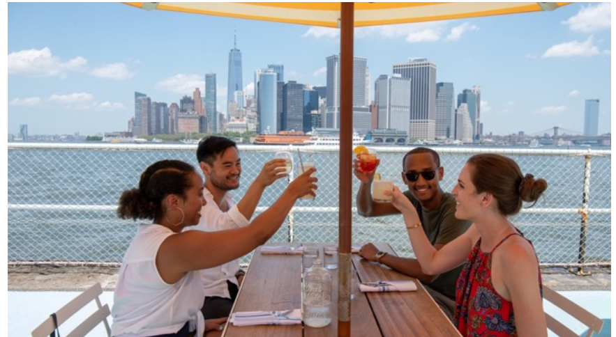
INCREASE AMENITIES WITH NEW F&B OPPORTUNITIES RESTAURANT/EVENT SPACE; BAKERY OR DISTILLERY WITH CAFÉ