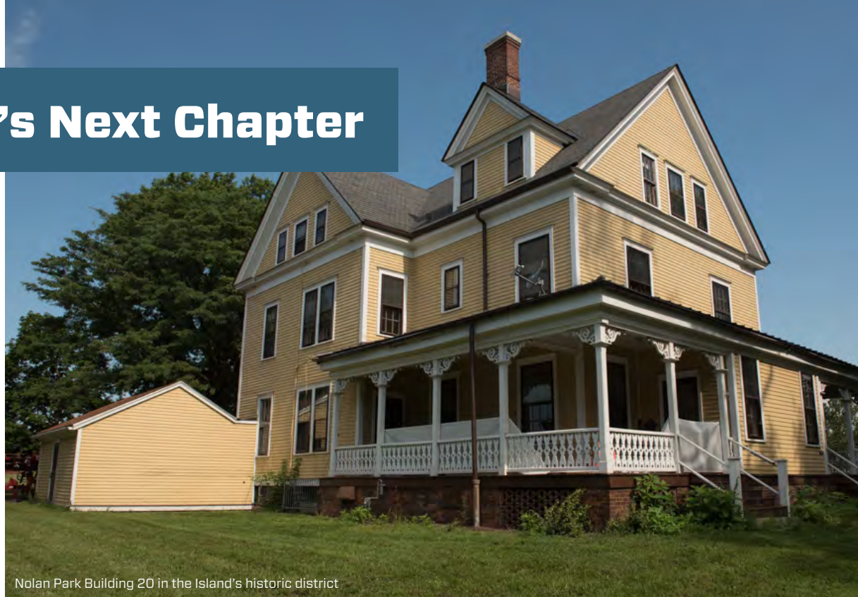
Nolan Park Building 20 in the Island's historic district

The Trust completed design and bid out drawings for the Island's planned new vehicle ferry, which will be the first battery hybrid ferry of its class in New York Harbor—cutting emissions and making harbor history.