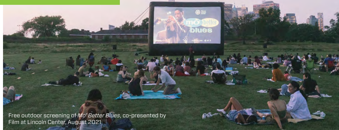
Free outdoor screening of Mo' Better Blues , co-presented by Film at Lincoln Center, August 2021