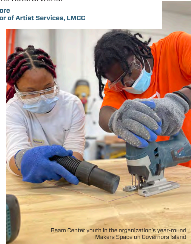
Beam Center youth in the organization's year-round Makers Space on Governors Island