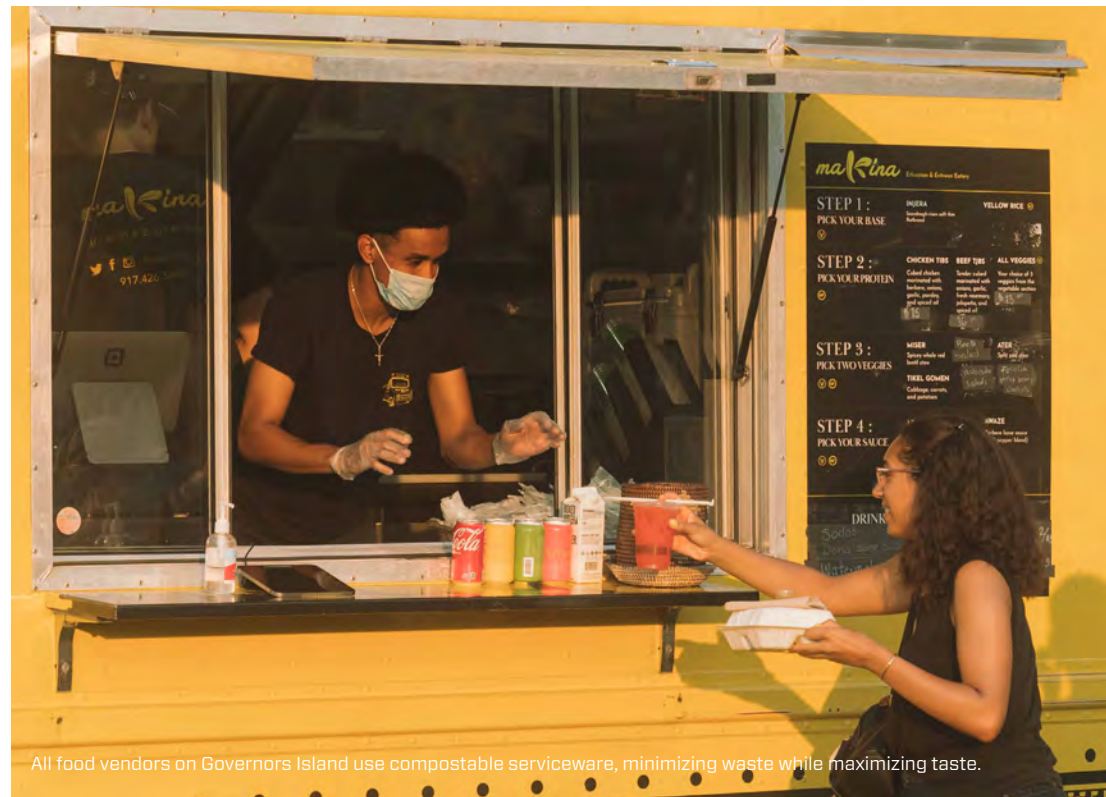
All food vendors on Governors Island use compostable serviceware, minimizing waste while maximizing taste.