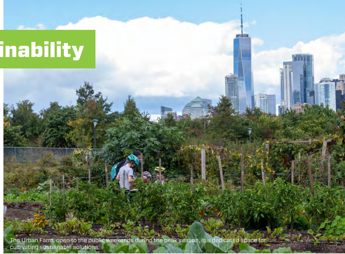
The Urban Farm, open to the public weekends during the peak season, is a dedicated space for cultivating sustainable solutions.

The GrowNYC Teaching Garden donated more than 10,000 lbs of produce grown on Governors Island to community-based organizations that support food-insecure New Yorkers, minimizing waste and advocating for increased food access.