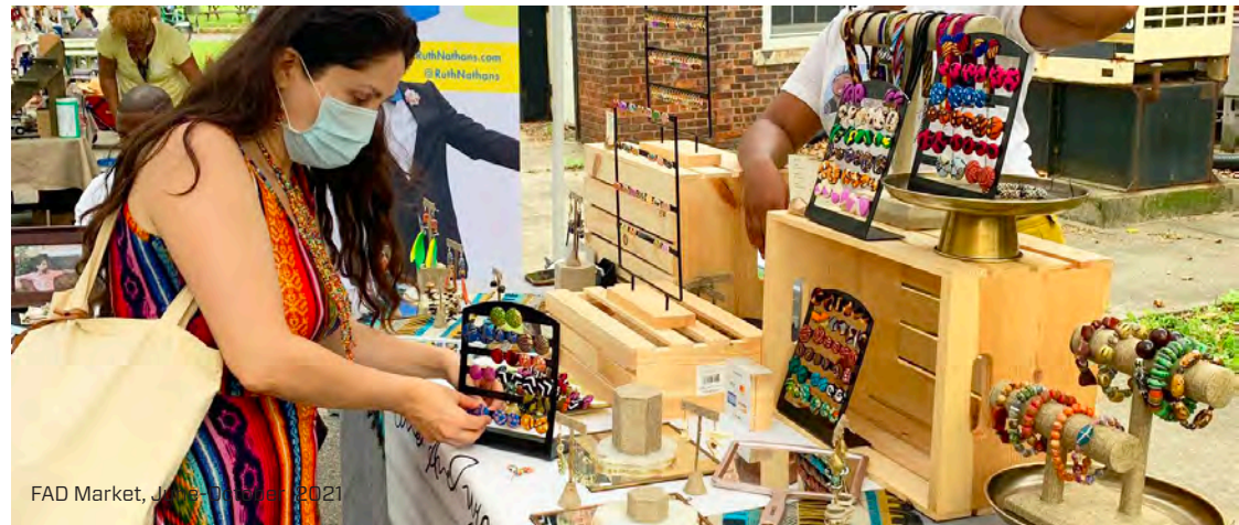
FAD Market, June 9-10, 2021