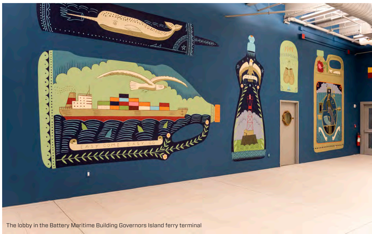
The lobby in the Battery Maritime Building Governors Island ferry terminal