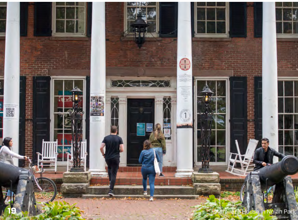
Admiral's House in Nolan Park