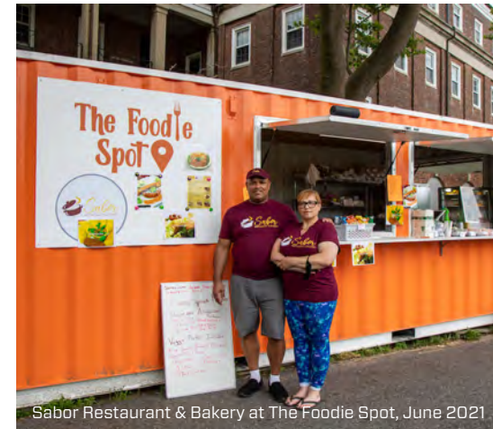
Sabor Restaurant & Bakery at The Foodie Spot, June 2021