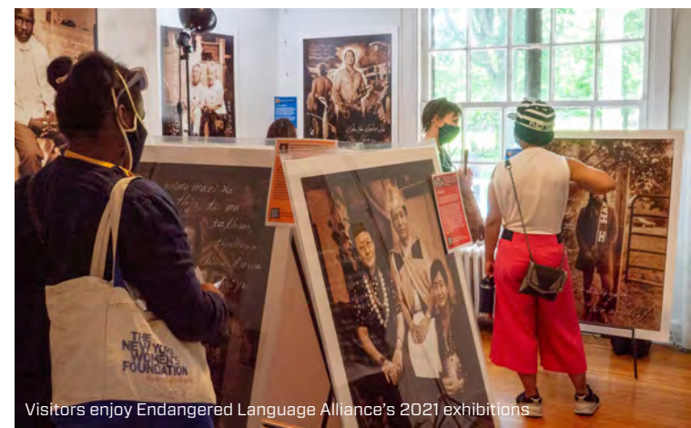
Visitors enjoy Endangered Language Alliance's 2021 exhibitions