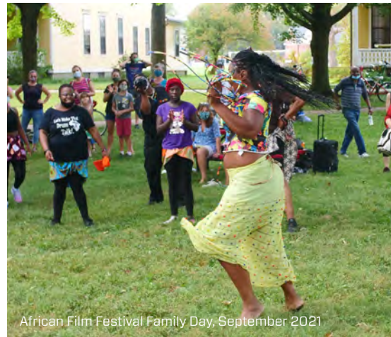
African Film Festival Family Day, September 2021