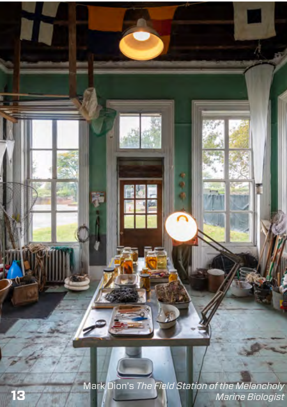
Mark Dion's The Field Station of the Melancholy Marine Biologist