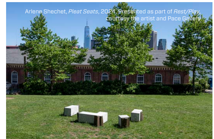
Arlene Shechet, Pleat Seats , 2024. Presented as part of Rest/Play , courtesy the artist and Pace Gallery.