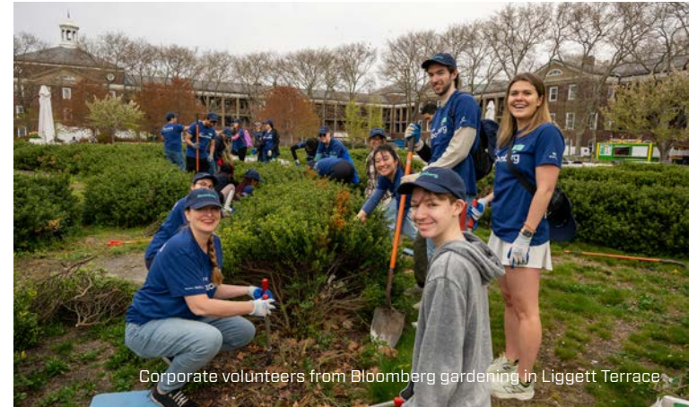
Corporate volunteers from Bloomberg gardening in Liggett Terrace.