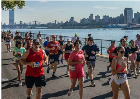
NYCRUNS 5K & 10Ks