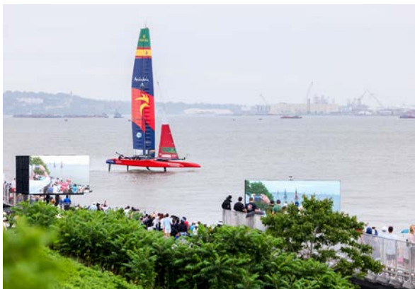
Mubadala New York Sail Grand Prix