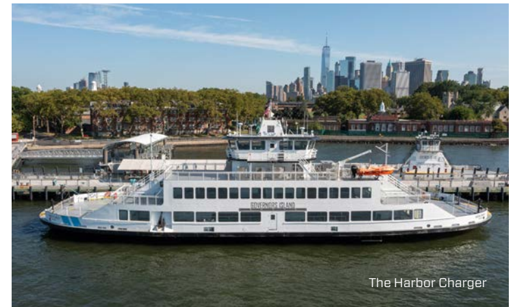
The Harbor Charger