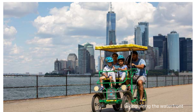
Biking along the waterfront