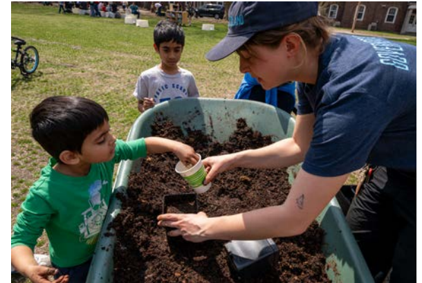
Earth Day Celebration