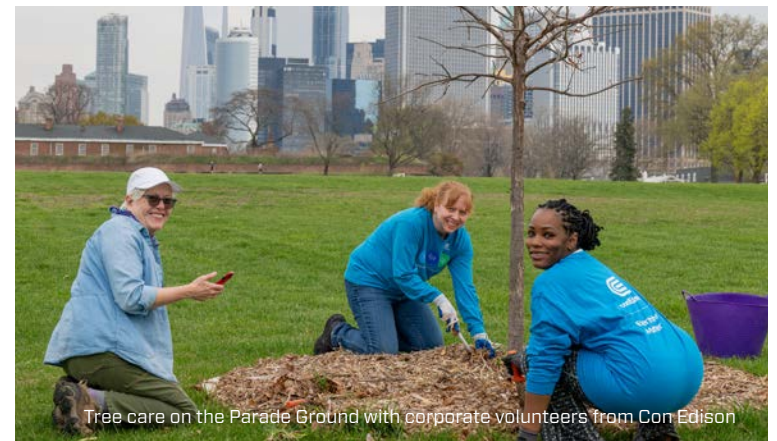
Tree care on the Parade Ground with corporate volunteers from Con Edison.

14,420 total hours of service contributed