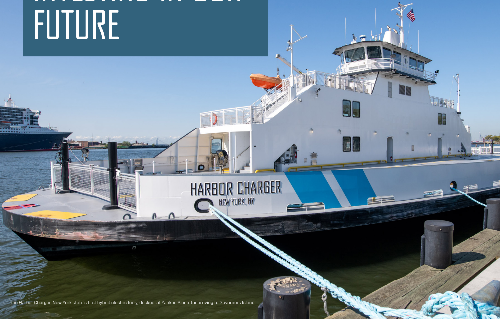
The Harbor Charger, New York state's first hybrid electric ferry, docked at Yankee Pier after arriving to Governors Island