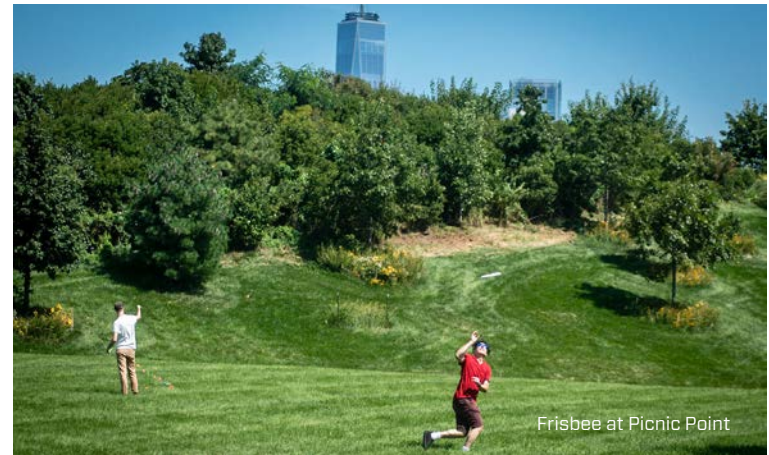
Frisbee at Picnic Point