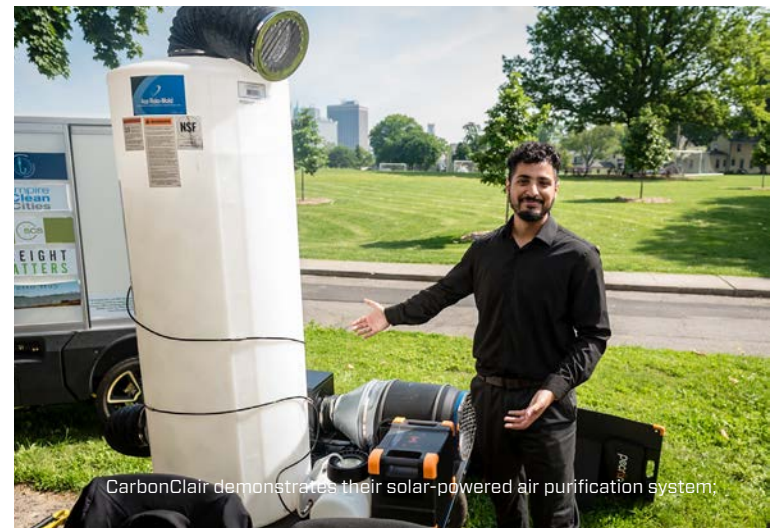
CarbonClair demonstrates their solar-powered air purification system.