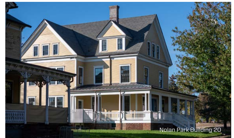
Nolan Park Building 20