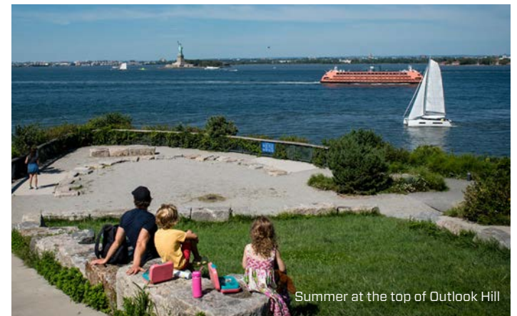
Summer at the top of Outlook Hill