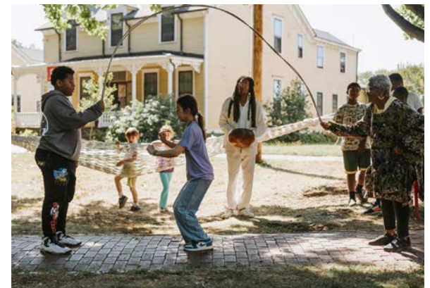
African Film Festival Family Day