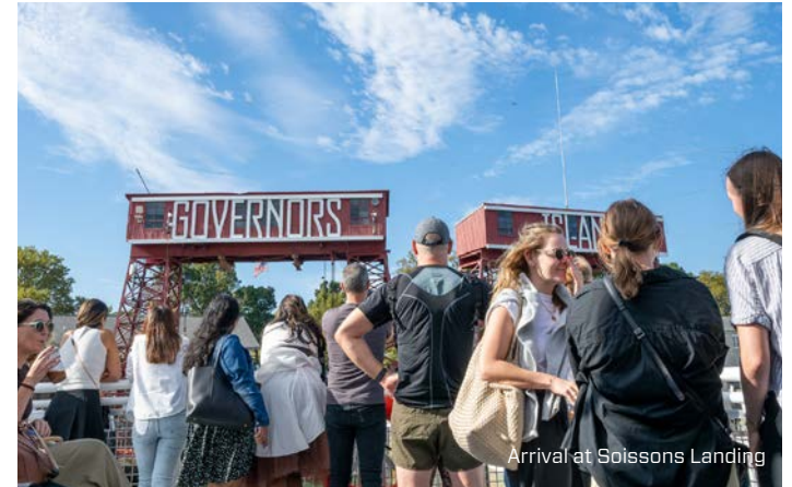
Arrival at Solissons Landing