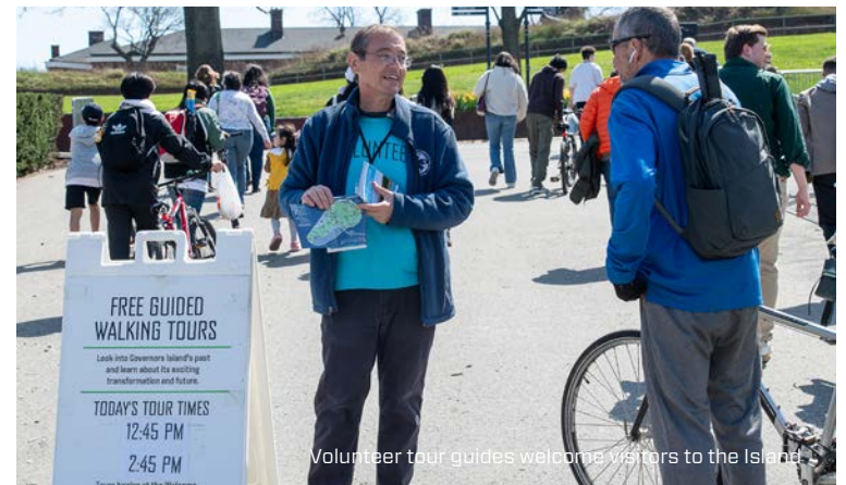
Volunteer tour guides welcome visitors to the Island.