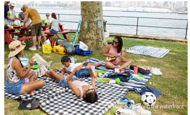
Picnicking along the waterfront