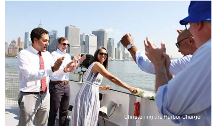
Christening the Harbor Charger