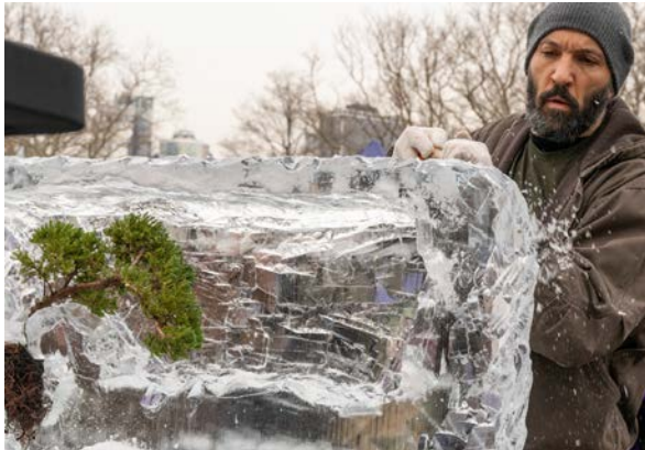
4th Annual Governors Island Ice Sculpture Show

Along with partners and organizers from throughout the five boroughs and around the world, we hosted nearly 95 events on the Island this year—the majority of which were free to attend. Highlights from 2025 include: