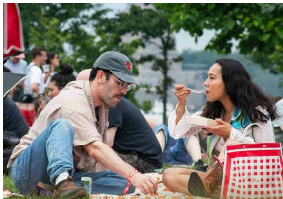
The Great Nosh