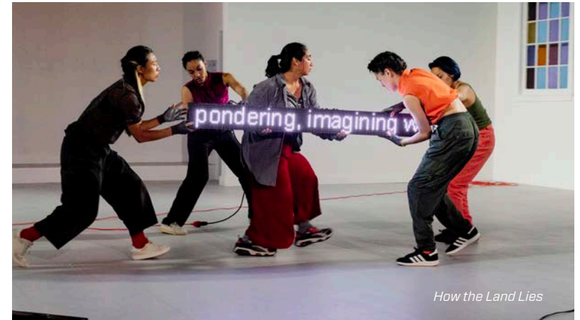
How the Land Lies